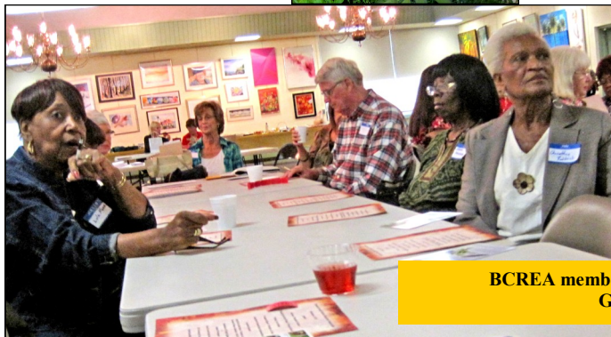
BCREA members can be verrrry serious-looking at times! Guess they didn't win the 50/50!