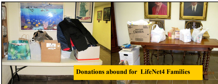
Donations abound for LifeNet4 Families