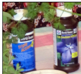
Donna uses only organic fertilizer and pest control.