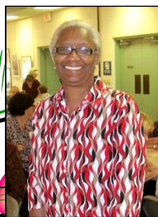
Nice smile - no nametag!