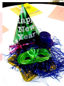
Seen at the January Meeting