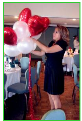
Scenes From the Luncheon