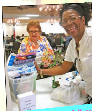
The book bin was full-up!