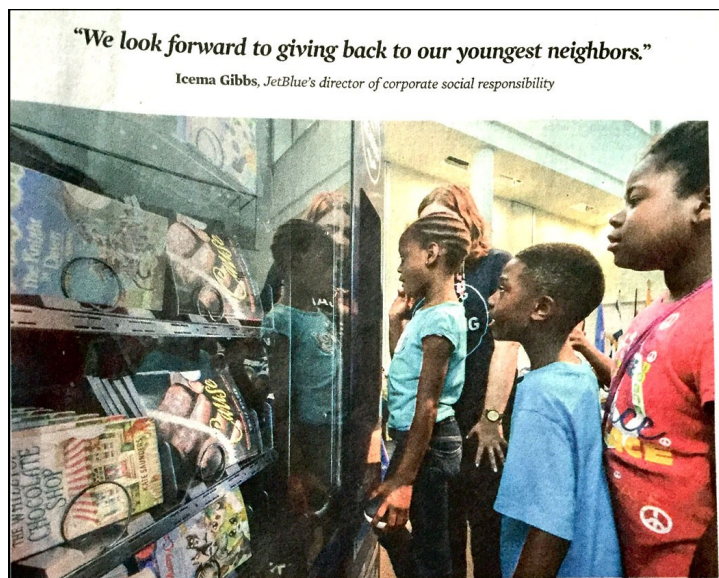
Children check out one of the vending machines full of books available to read as part of JetBlue Airways' Soar with Reading Program. Fort Lauderdale won 65 percent of votes cast in the national online #BookBattle competition.

Thanks to everyone who voted in the JetBlue Soar With Reading competition, Fort Lauderdale was the national winner. This article appeared in the SunSentinel.