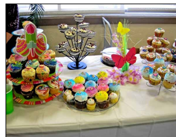
Cupcakes instead of a "Congratulations Winners" cake this year.

The cost of BCREA Newsletter is underwritten by