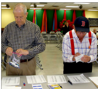
Seen at the January Meeting