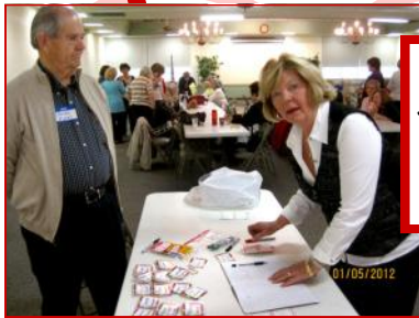
Charles welcomes a guest