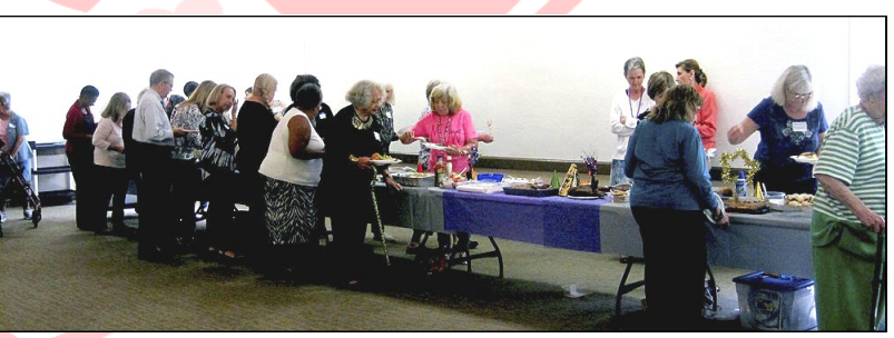
The Lunch line-up - 67 this month!