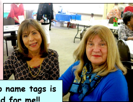
No name tags is bad for me!!