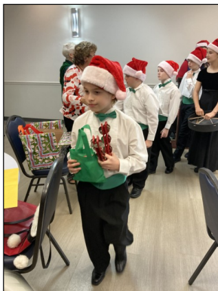
The singers received "swag bags" as a reward for a fine performance.