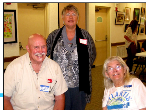
Seen at the April Meeting