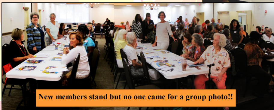
New members stand but no one came for a group photo!!